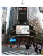
Thanks to donated space from multiple magazine publishers and newspapers, the "Let's recycle right!" print PSA campaign provides simple tips to help people recycle right.