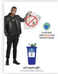
Kendrick Sampson actor