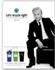
Bill Maher comedian, commentator, host